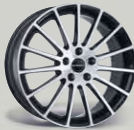
Design LS 17-18" schwarz-polier t auch in graphit-polier t