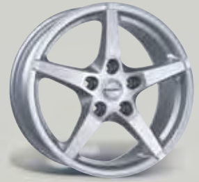
Design FS 16-18" brillantsilber-lackiert