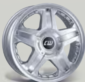
Design CWB 18-22" kristallsilber-lackiert