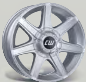
Design CWE 8x17" kristallsilber-lackiert