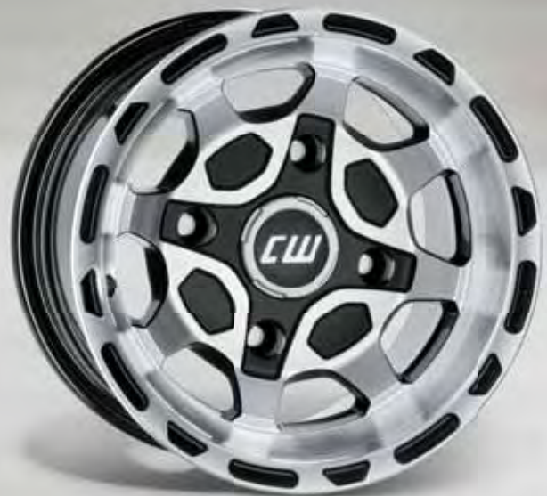
Design CWQ black 7x12" ET 0/20 schwarz-poliert