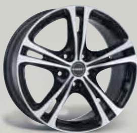
Design XL 17-18" schwarz-polier t