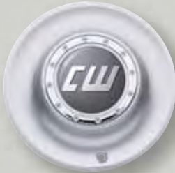
Best.-Nr.: 387 Design CW 7x16