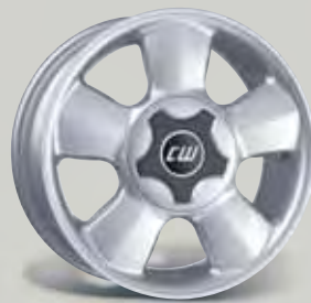
Design CV 16" kristallsilber-lackiert