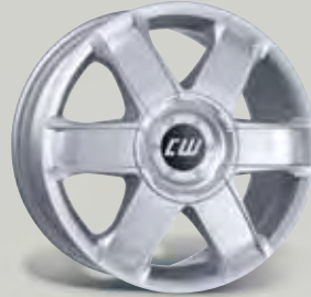
Design CWA 17" kristallsilber-lackiert