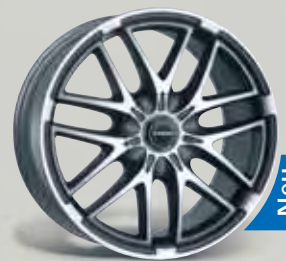
Design XA 19-20" anthrazit matt-finish