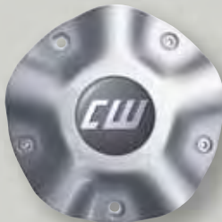
Best.-Nr.: 9233/L Design CD 7x15, 7x16