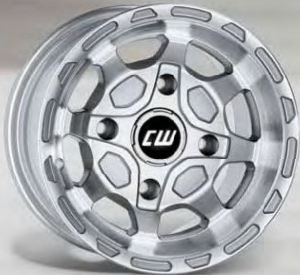
Design CWQ silver 7x12" ET 0/20 silber-poliert

Die Räder werden mit und ohne Bereifung angeboten.