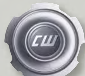
Best.-Nr.: 513 Design CWC 6,5x16