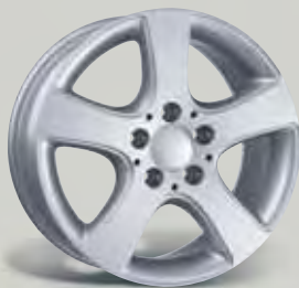
Design TA 16-17" brillantsilber-lackiert