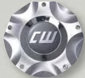
Best.-Nr.: Z0191/L Design CX 10x20