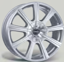
Design TS 17-19" dekorsilber-lackiert