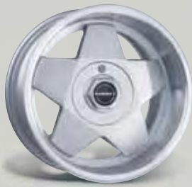
Design A 16" silber-hornpoliert