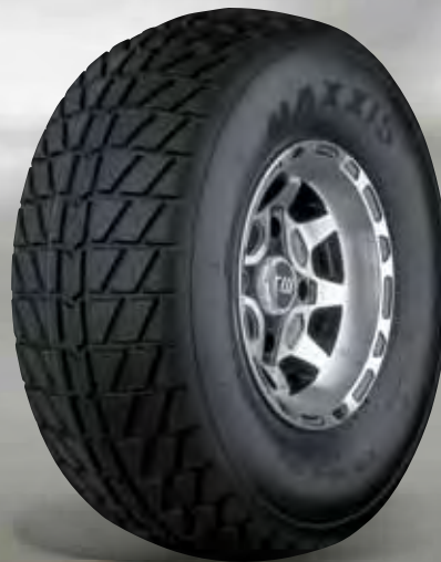
Design CWQ black mit Maxxis 270/60 - R12 50N (Straßenprofil)