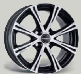
Design X8 14-17" schwarz-polier t