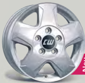
Design CG 15" kristallsilber-lackiert