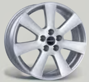
Design CA 14-18" kristallsilber-lackiert 18" auch in kugelpoliert