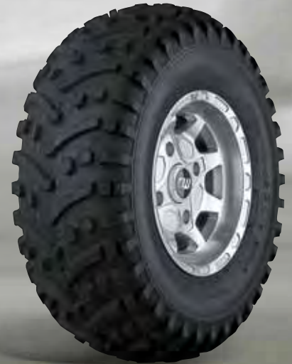
Design CWQ silver mit Maxxis 25x10-R12 (Geländeprofil)