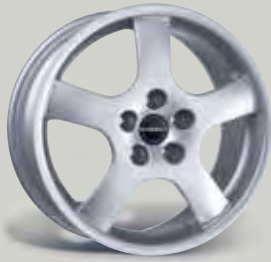
Design CB 14-17" kristallsilber-lackiert