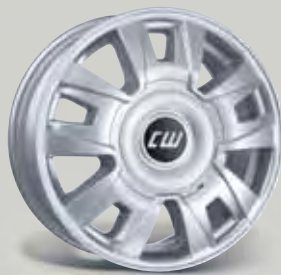
Design CWC 16" kristallsilber-lackiert