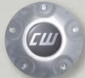
Best.-Nr.: 43302/L Design CV 8x18 ET 30-50