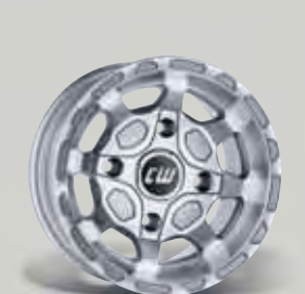
Design CWQ (ATV) 12" silber-polieret