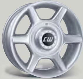
Design CW 7x16" kristallsilber-lackiert