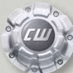
Best.-Nr.: 842 Design CWE 8x17