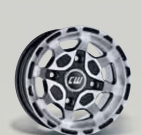
Design CWQ (ATV) 12" schwarz-polieret