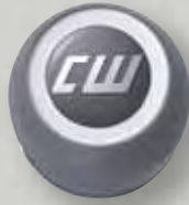
Best.-Nr.: 1970/L Design 8x15, 8x16 Off-Road Fahrzeuge