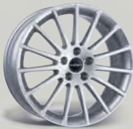
Design LS 15-18" kristallsilber-lackiert