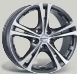
Design XL 17-18" graphit-polier t