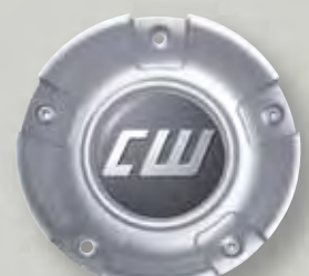
Best.-Nr.: 43304 Design CWB 9x20, 10x22