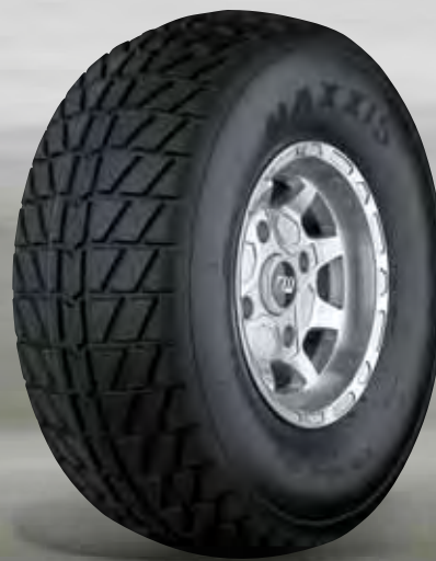
Design CWQ silver mit Maxxis 270/60-R12 50N (Straßenprofil)