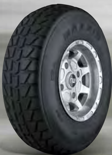
Design CWQ silver mit Maxxis 185/88-R12 40N (Straßenprofil)