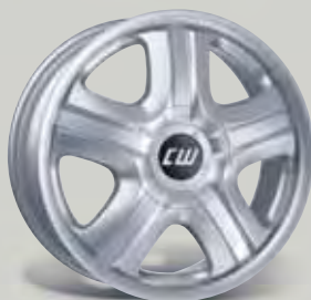
Design CX 7x17" kristallsilber-lackiert