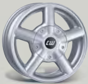
Design CD 15-16" silber-lackiert