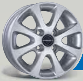
Design BO 01 13" kristallsilber-lackiert