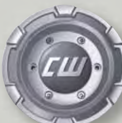
Best.-Nr.: 5710/L Design CWA 8x17