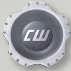
Best.-Nr.: 5271/L Design CY 6,5x15