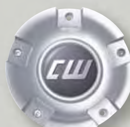
Best.-Nr.: 515 Design CWB 8x18