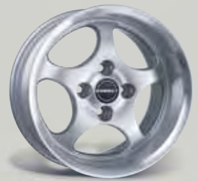
Design T 14+16" silber-hornpolier t