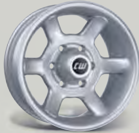
Design 8x15" · 8x16" silber-lackiert