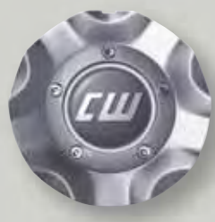
Best.-Nr.: 384 Design CX 7x17 Best.-Nr.: Z0190/L Design CX 8x17