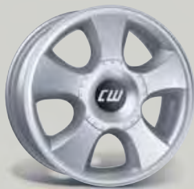
Design CY 15" kristallsilber-lackiert