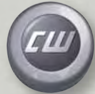
Best.-Nr.: 1973/L Design 8x15, 8x16, Design CW 7x16 Range Rover, Land Rover