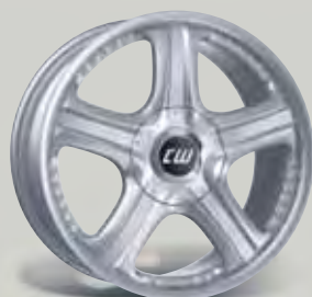
Design CX 8x17" · 10x20" kristallsilber-lackiert