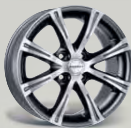
Design X8 14-17" graphit-polier t