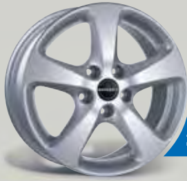
Design CC 15-17" kristallsilber-lackiert