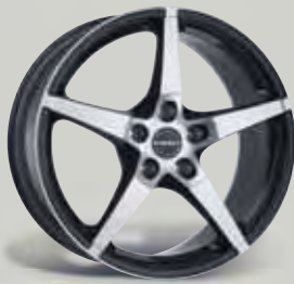
Design FS 18" schwarz-polier t