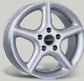
Design CF 13-16" kristallsilber-lackiert