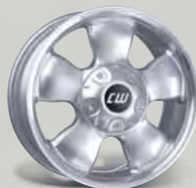
Design CV 18" kristallsilber-hornpoliert