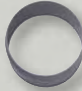
Best.-Nr.: 1975 Design 8x15, 8x16, Design CW 7x16 Off-Road Fahrzeuge