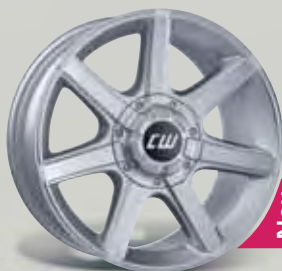
Design CWE 8,5x18" kristallsilber-hornpoliert