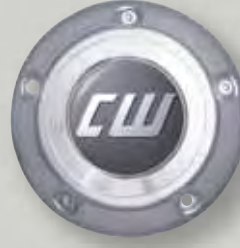
Best.-Nr.: 43301/L Design CV 6,5x16, 8x16, 8x18 ET 0-20 Nabendeckel hoch