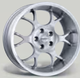
Design BS 15-17" kristallsilber-hornpoliert