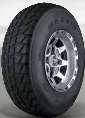
Design CWQ black mit Maxxis 185/88 - R12 40N (Straßenprofil)