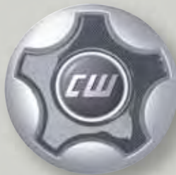
Best.-Nr.: 3699/L Design CV 6,5x16, 8x16 Nabendeckel flach